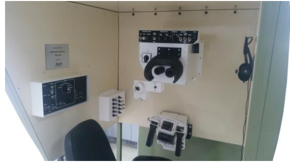
Gunner's cabin M-84 simulator