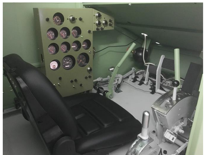
Interior of tank driver compartment of tank M-84 simulator