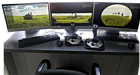
Instructor position of tank M-84 simulator