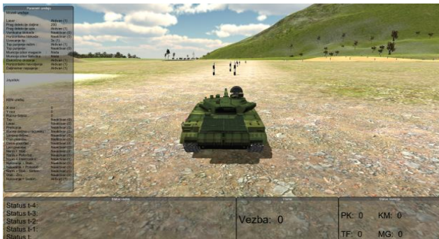
3 th person view for instructor