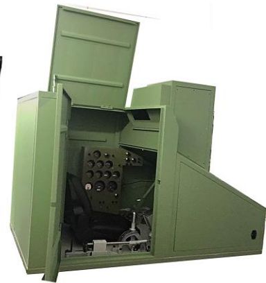
Tank driver compartment of tank M-84 simulator