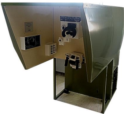
Tank gunner compartment of tank M-84 simulator